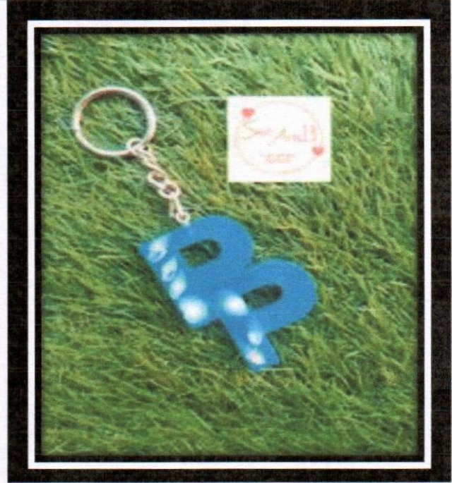
Customized Wrapped gift packages ..Products of Sweet Art 13