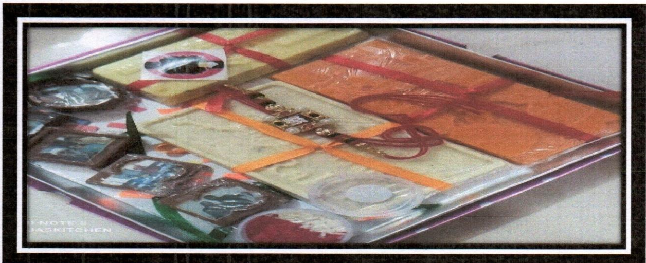
CustomizedRakshbandhan Gifts Hamper :- Product of Rutuja’s Kitchen