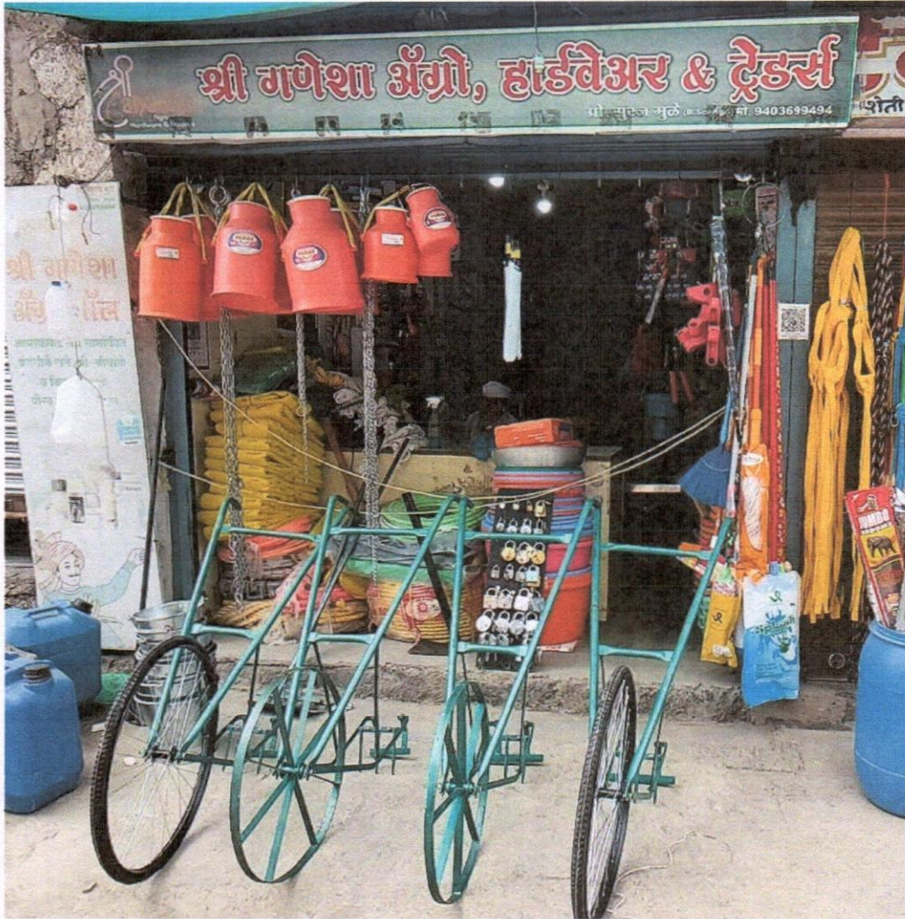
IBMRD Student Mr.Suraj Mulay startup Shri Ganesh Agro,Ashti Dist. Beed