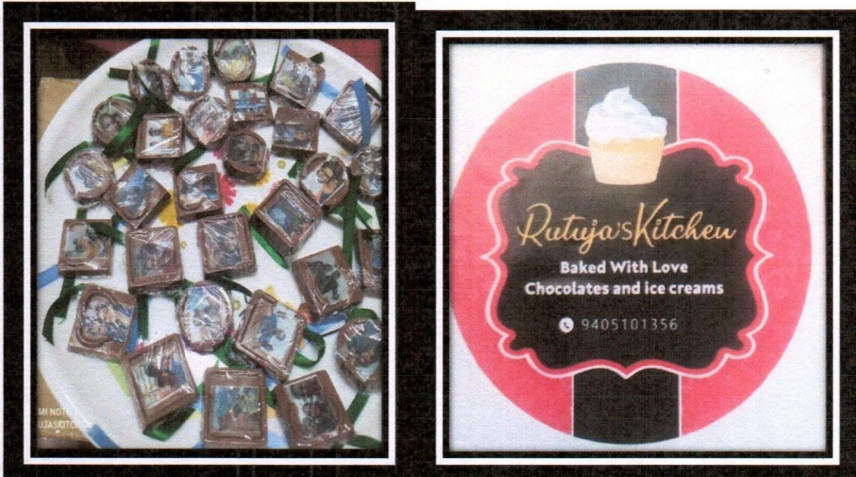
Customized Photo Chocolates Gifts Hamper .Product of Rutuja’s Kitchen

Nature of start up – Customized homemade Chocolates and Icecream,Chitale road,Ahmednagar.